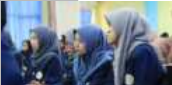
Monitoring and Evaluation (Monev)