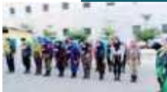
Diklatsar (Pendidikan dan Pelatihan Dasar)