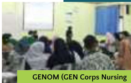
GENOM (GEN Corps Nursing Competition)