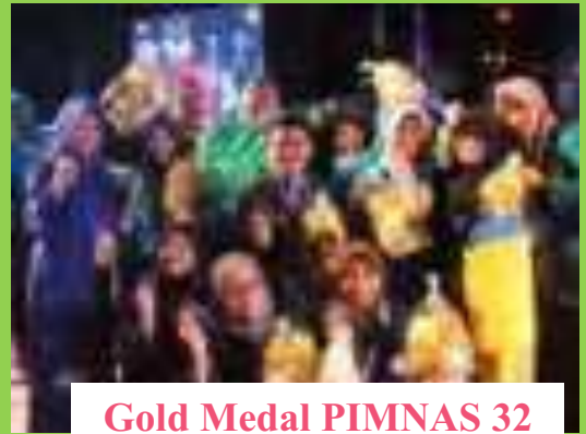
Gold Medal PIMNAS 32