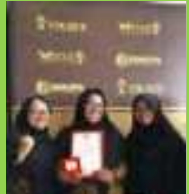
Gold Medal "World Invention and Technology Expo"