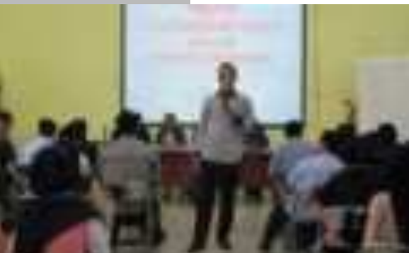
Legislative Course (LC)

Badan Legislatif Mahasiswa (BLM) or Legislative Student Council is one of student organizations in the Nursing Faculty, Universitas Airlangga. As the Legislative organization we have several functions that almost same as the legislative institutions in government, such as : accomodate students aspirations, make a law that will be used and applied in regulating student oraganizations' activities, and supervise all the performance of Executive Student Council or Badan Eksekutif Mahasiwa (BEM) and also their additional agency or Badan Kelengkapan (BK).