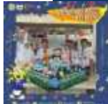
Natural and Education Science Competition in Nursing (NEURON)