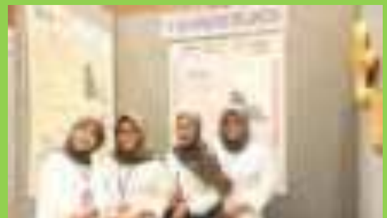
Silver Medal "World Invention and Technology Expo"