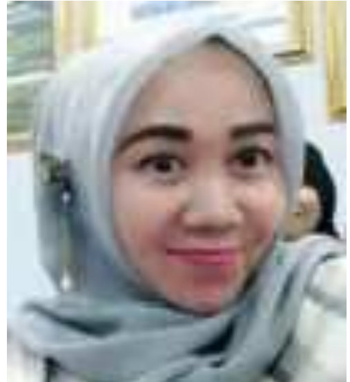
Vice Dean of Research Innovation Community Development

Students of the Faculty of Nursing Universitas Airlangga have the opportunity to take part in an international internship program at an overseas hospital. Students will run this internship program for the specified time duration. Knowledge that will be counted as SKS in education. This program significantly improves student experience and knowledge.