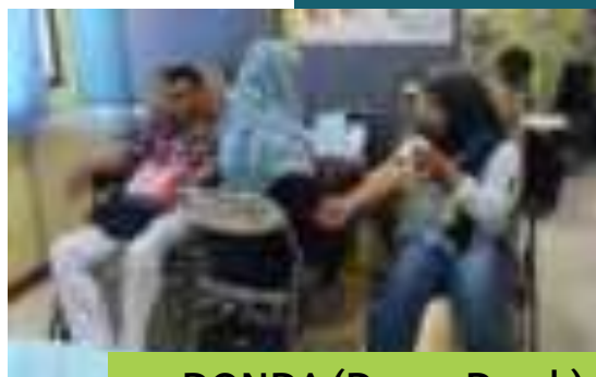
DONDA (Donor Darah)