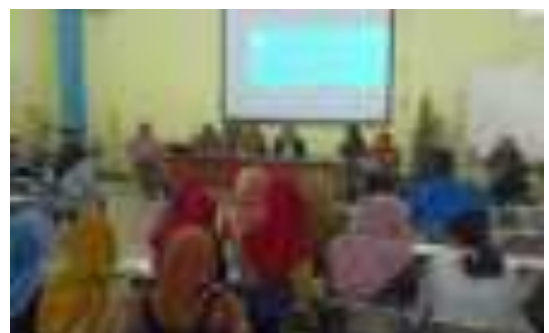
AUDIENSI DEKANAT or AUDIENCES WITH DEAN