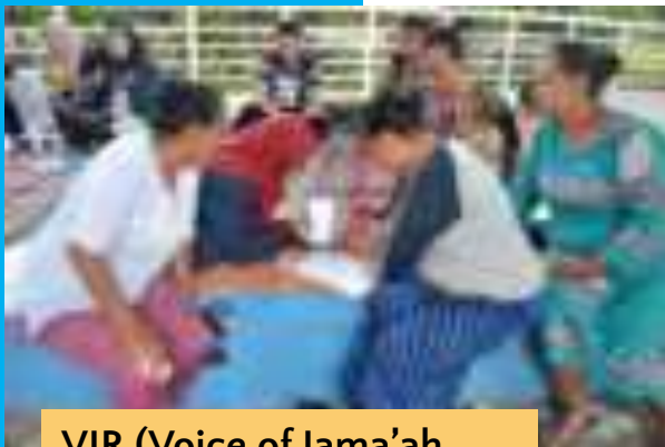
VJR (Voice of Jama'ah Rufa'idah)

This organization has a place for Badan Kelengkapan (BK) of Badan Eksekutif Mahasiswa (BEM) Fakultas Keperawatan (FKP) Universitas Airlangga) with the motto “we are moeslim, so we care” and has a function of doing islamic ukhuwah (friendship in arabian), improving the understanding of islamic religion, and also actively to responding-making the environment of college’s students for their opinion about health problem and Islamic abouts. On top of that, SKINers has actively doing workshop and public’s actions with some communities.