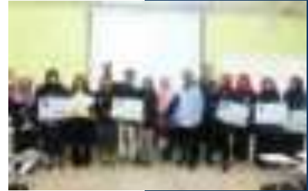
Nursing Debate Competition (NDC)