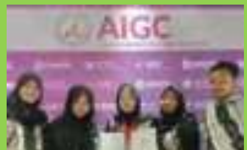
Silver Medal AIGC Singapore