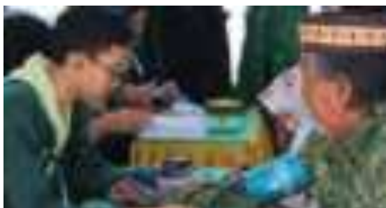
GBGC (Gelar Bakti GEN Corps)