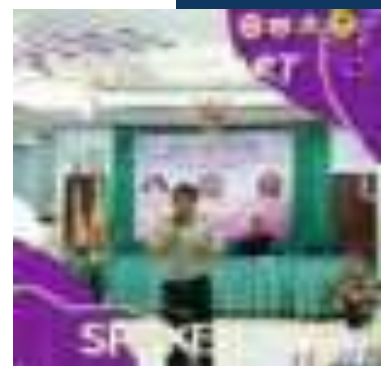
National Nursing Professional Seminar (SPOKEN)