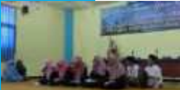
SERUNAI (Semarak Ramadhan Universitas Airlangga)