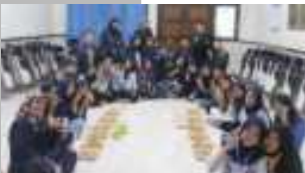
School of Legislative (SOL)