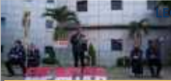
Pemilihan Umum Raya (PEMIRA) or Great Public Election